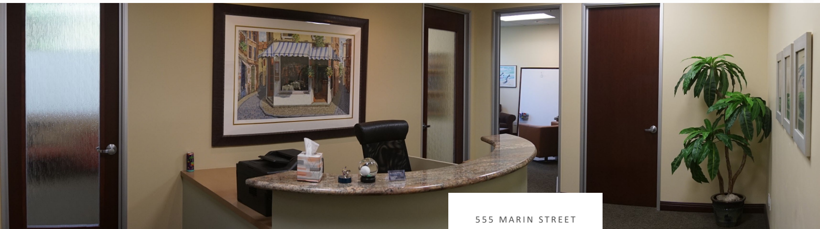
555 MARIN STREET