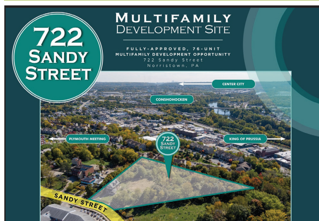
722 SANDY STREET 76 UNITS NORRISTOWN, PA BID PROCESS