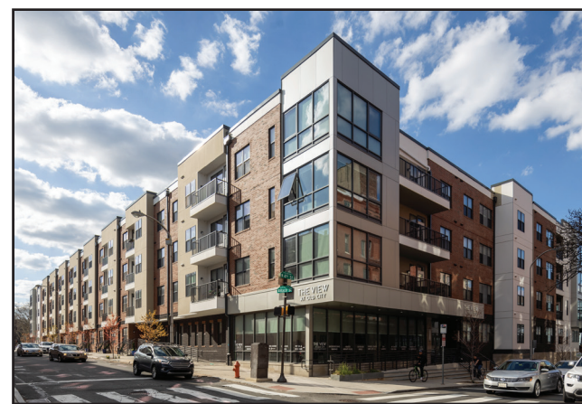
THE VIEW AT OLD CITY 216 UNIT PHILADELPHIA, PA BID PROCESS