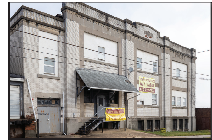
215 QUARRY ST 28 UNIT WHITEHALL, PA