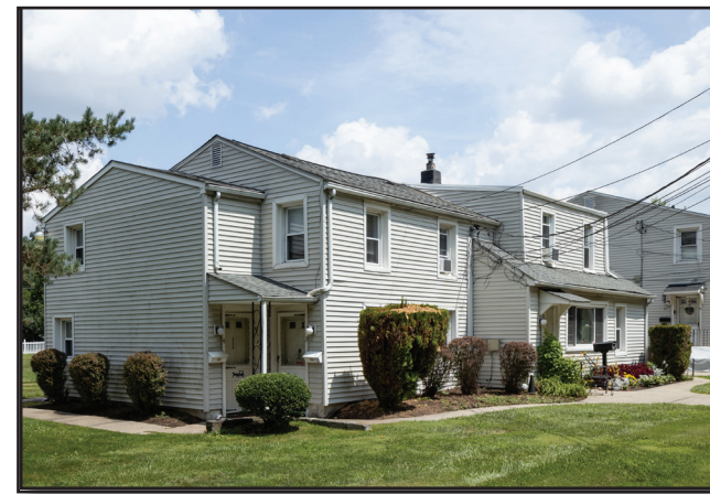
PARK AVENUE APARTMENTS 13 UNIT BRISTOL, PA