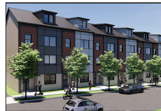
COLLEGE AVE TOWNHOMES 53 TOWNHOMES LANCASTER, PA UNDER PRICE AGREEMENT