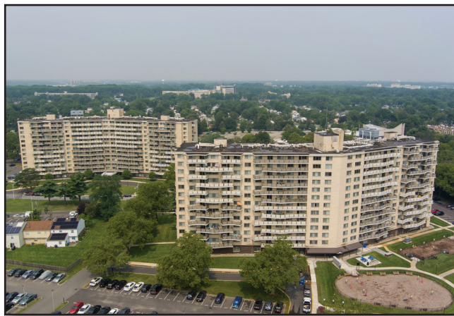
TOWERS OF WINDSOR PARK 525 UNITS CHERRY HILL, NJ