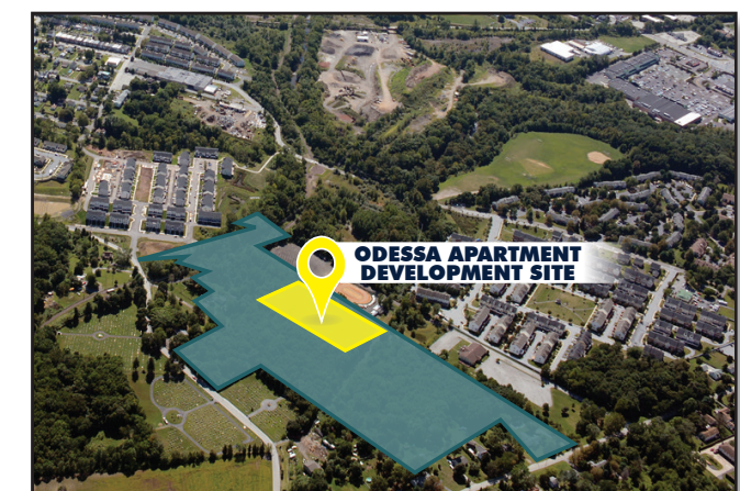
ODESSA APARTMENTS 2 ACRES, 225 UNITS PHOENIXVILLE, PA UNDER PRICE AGREEMENT