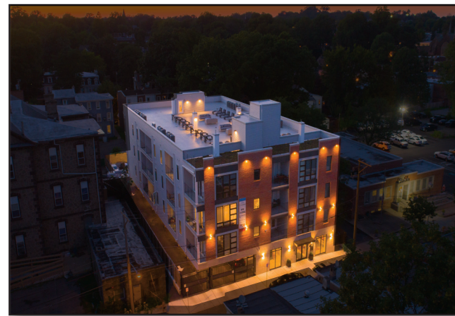
GERMANTOWN SQUARE 33 UNITS PHILADELPHIA, PA