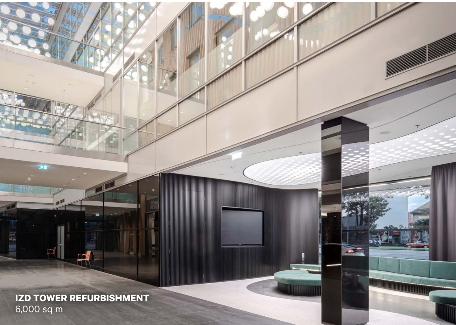
IZD TOWER REFURBISHMENT 6,000 sq m