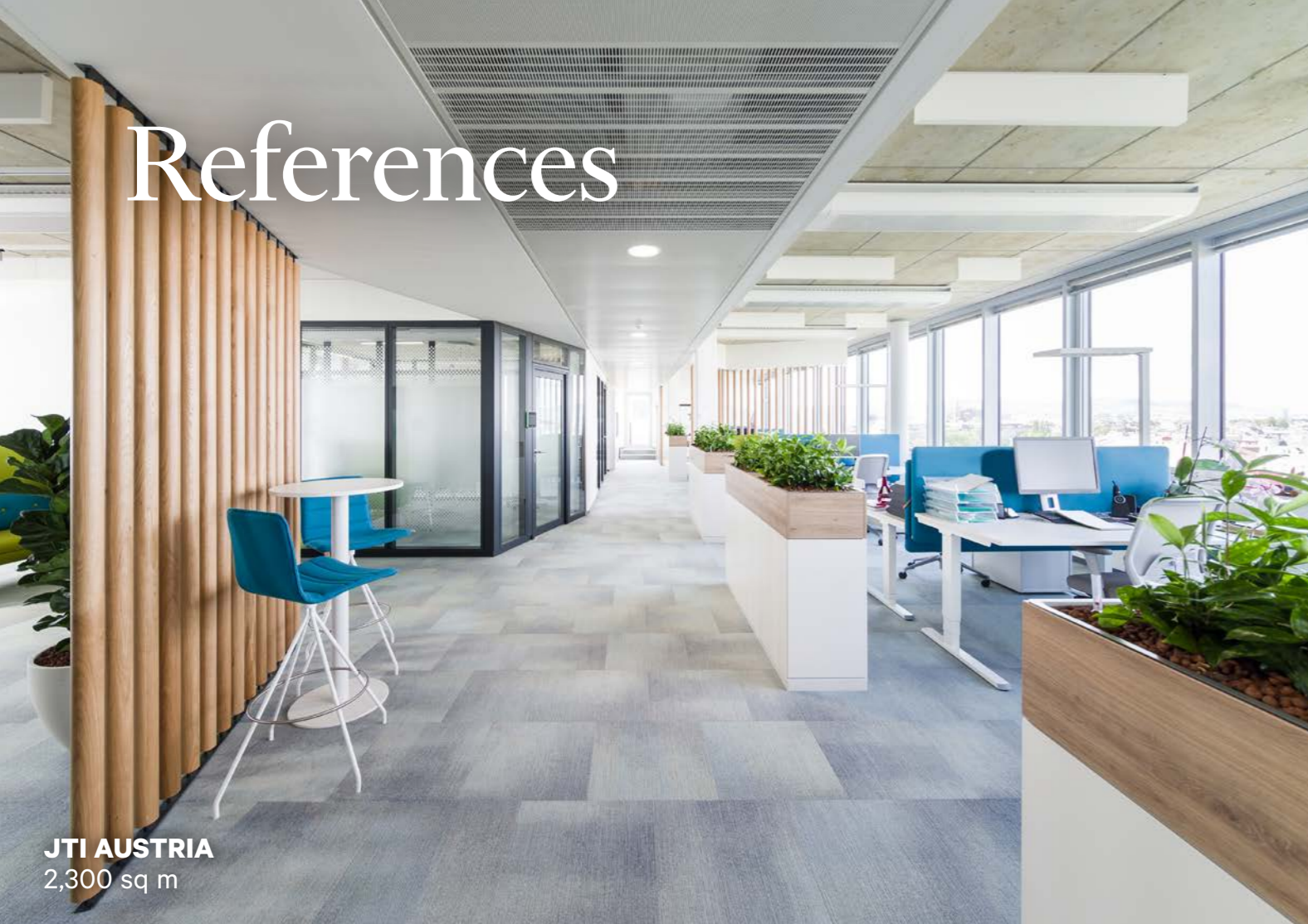
JTI AUSTRIA 2,300 sq m