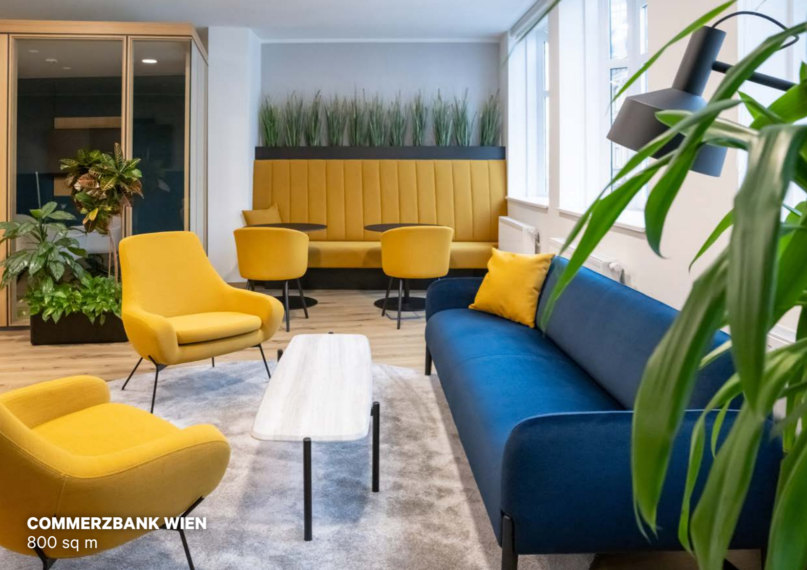
COMMERZBANK WIEN 800 sq m