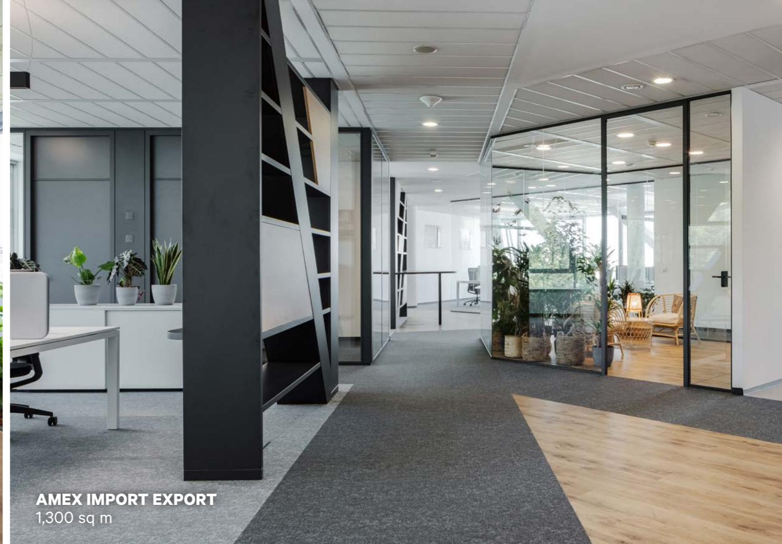
AMEX IMPORT EXPORT 1,300 sq m